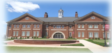
UGA — Griffin Campus, Griffin, GA